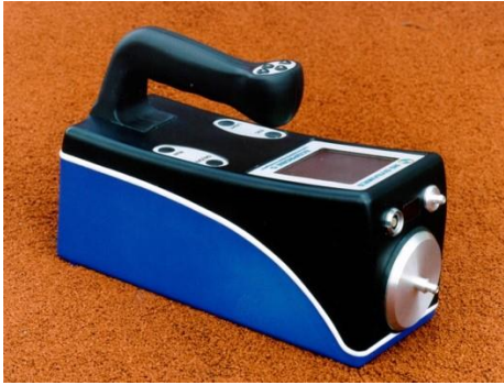
Model : ECOPROBE 5